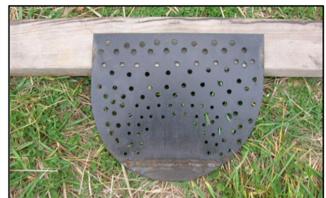
The primary air distribution plate.