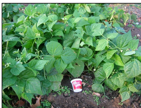
Beans with biochar.