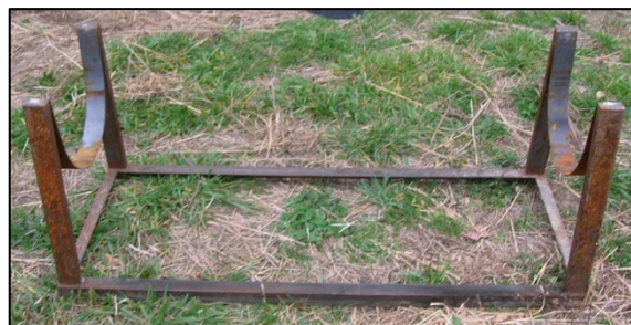
The base stand. For best results, place on a slight incline, with the flue end up.