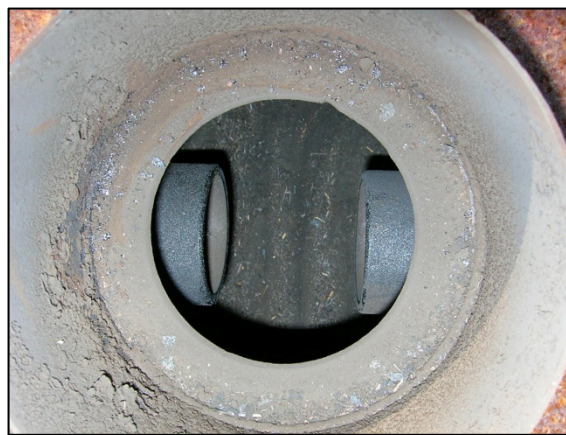
A close up view of the concentrator plate and the interior of the flue ring that holds the chimney in place.

For safety, I wear a good quality dust mask and welding gloves when I am handling the hot materials. ♦