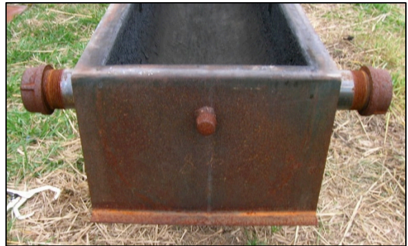
Secondary air intakes are on the sides and the lighting/thermocouple port is on the end of the vessel.