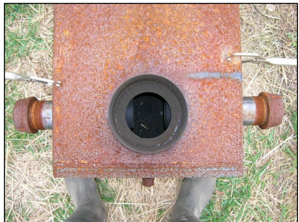
With the lid in place, you can see the concentrator plate and the placement of the air intakes.