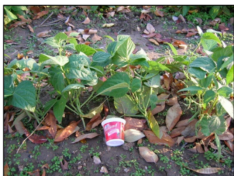
Beans without biochar.