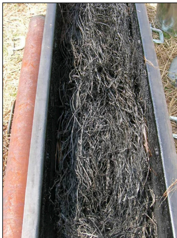
The finished product: switchgrass biochar.