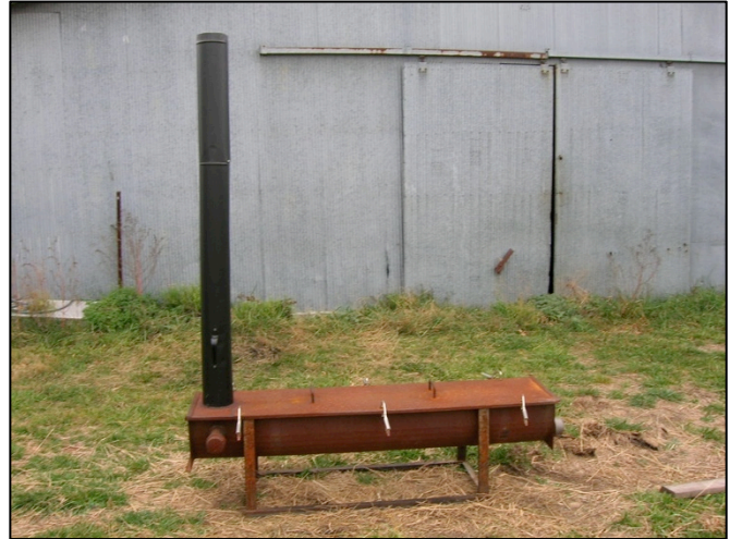
The complete unit.

The Biochar Processor is a gasifier that works similarly to a Top-Lit Updraft gasifier, except that the configuration is horizontal. A flaming pyrolysis front moves through the feedstock material, heating it and gasifying it. The gas is combusted above the pyrolysis front, resulting in clean combustion with very little smoke. It is especially designed for processing switchgrass.