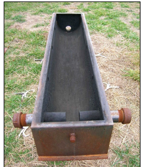
The vessel. The primary air inlet is visible at the far end. The primary air distribution plate has been removed. On the near end you can see the pair of secondary air intakes and the smaller lighting/thermocouple port.

The main part of the vessel, before the ends are welded on is six feet in length. This piece was rolled out of ten gauge mild steel. The interior width of the vessel is 12 1/4" and is 10 5/8" deep in the center. The total width of the vessel including the lip is 15 5/8". The total length of the vessel with the two ends welded on is 6' 1/4"