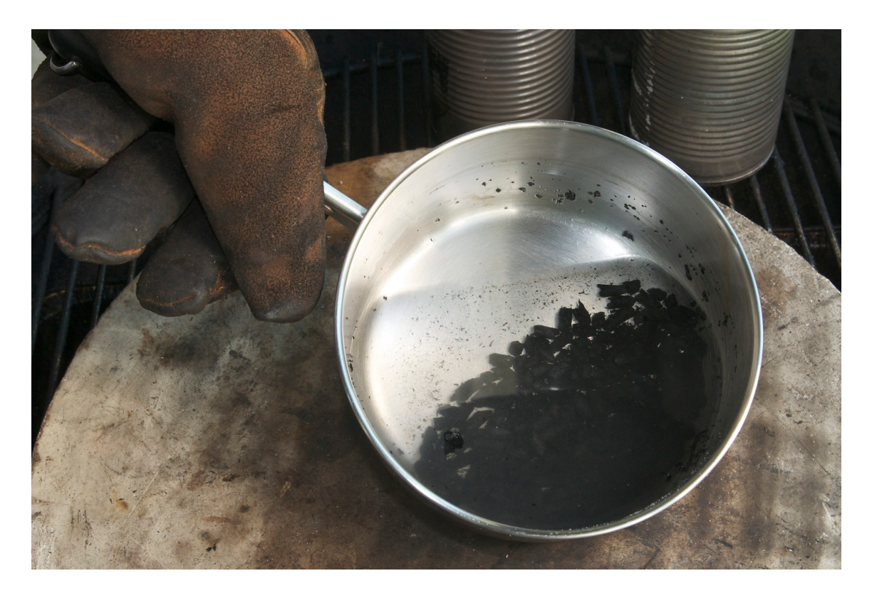
Evaluating your biochar

Set the bottom can back inside the windshield/safety can to cool off. It will be hot for a few minutes.