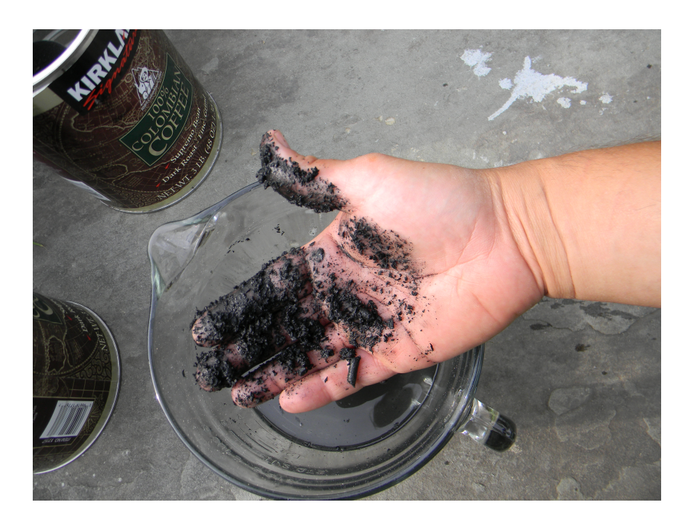
"Grind" the biochar into your skin as it you meant it to stay there forever.