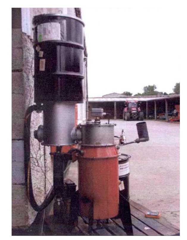
Figure 1: GEK Imbert down-draft gasifier.

The gasifier used in this investigation was a GEK Imbert down-draft gasifier<sup>2</sup> which consists of a hopper for feedstock storage, a reactor where the gasification process occurs, a cyclone, and a charcoal filter through which the synthetic gas passes en route to a flare (Figure 1). The rate of biomass flow is controlled by gravity and is fed into the reactor by means of a feed-in auger. The rate of gas flow is controlled by an air compressor which controls the pressure over the gasifier: increasing the flow of air increases the pressure over the reactor and thus increases the flow of gas through the gasifier.