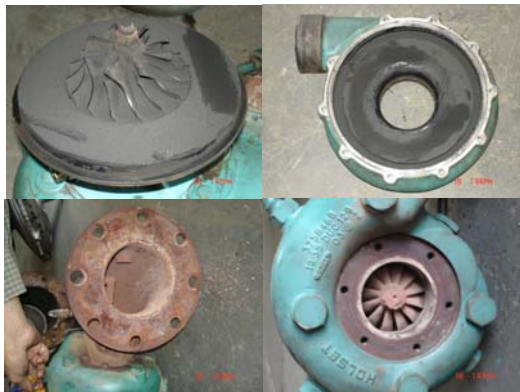
Figure 3: The compressor and turbine after 5000 hours of operation