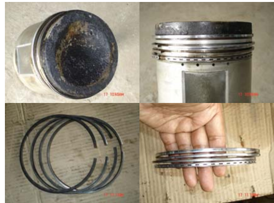
Figure 5: Piston and Piston rings after 5000 hours of operation