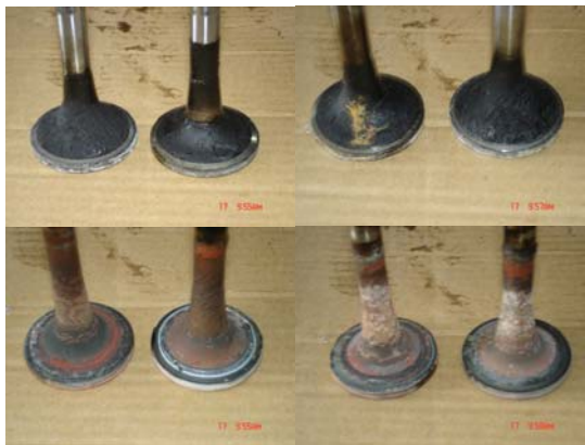
Figure 4: Intake and exhaust valves after 5000 hours