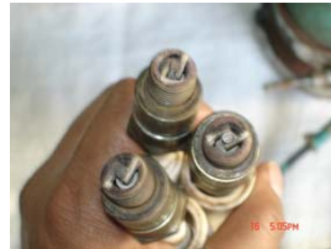
Figure 6: Spark plugs after 5000 hours of operation

The inspection was found encouraging and also qualified the gasifier for its clean fuel generation. Table 2 indicates the piston ring gap measurements on two sets of producer gas engines. The contact pattern and wear is found uniform and within the allowable limits.