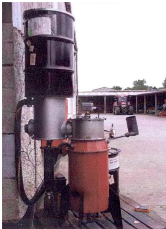
Figure 1: GEK Imbert down-draft gasifier.

The gasifier used in this investigation was a GEK Imbert down-draft gasifier 2 which consists of a hopper for feedstock storage, a reactor where the gasification process occurs, a cyclone, and a charcoal filter through which the synthetic gas passes en route to a flare (Figure 1). The rate of biomass flow is controlled by gravity and is fed into the reactor by means of a feed-in auger. The rate of gas flow is controlled by an air compressor which controls the pressure over the gasifier: increasing the flow of air increases the pressure over the reactor and thus increases the flow of gas through the gasifier.