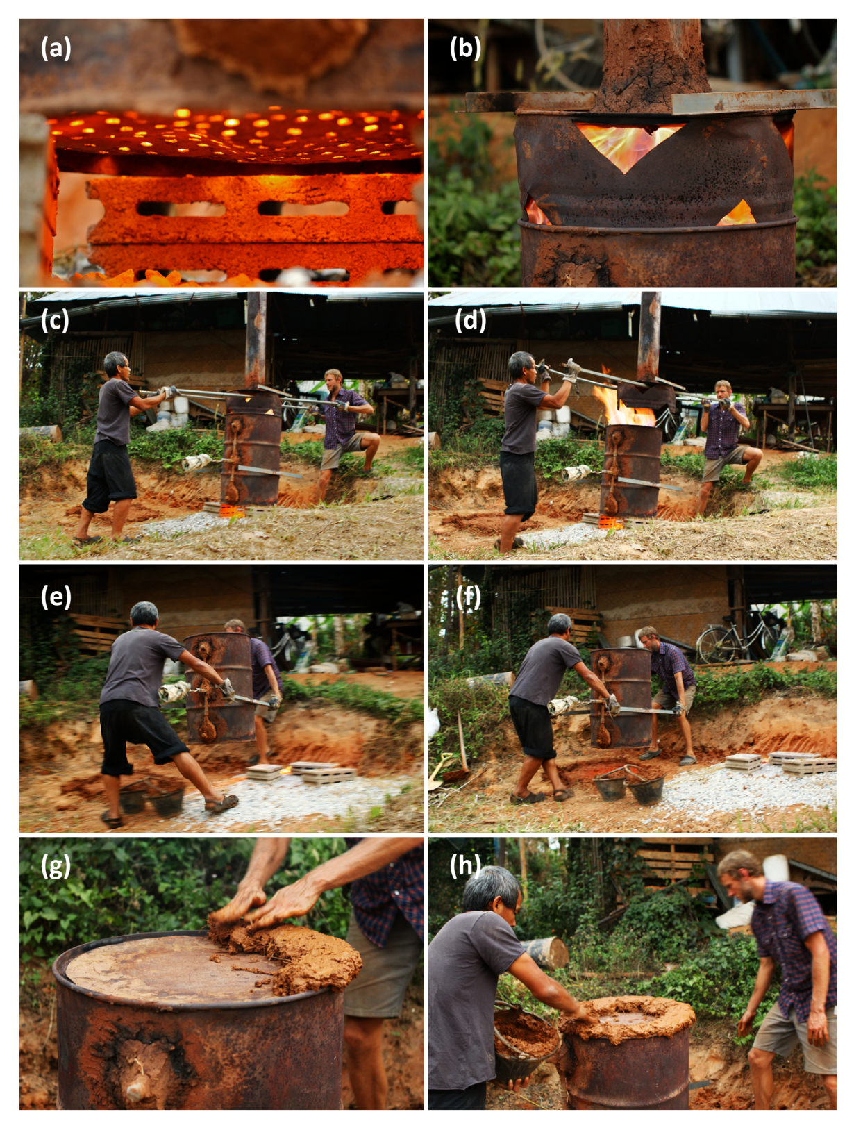
Photo series showing shutdown procedure: When bottom of drum begins to glow (a) and blue flames appear in crown (b) then pyrolysis is nearing completion. Remove the crown and chimney (c) and (d). Put on the lid and move the reactor body to the adjacent mud pit to seal the bottom (e) and (f). Seal the top with mud to prevent air leaks (g) and (h).