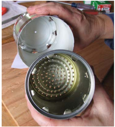
Step 5: Assemble the inner and outer cans

Place the inner can inside the outer can. Line up the holes you punched earlier. Screw the 8x1 sheet metal screw into the bottom of the outer can and up into the inner can.