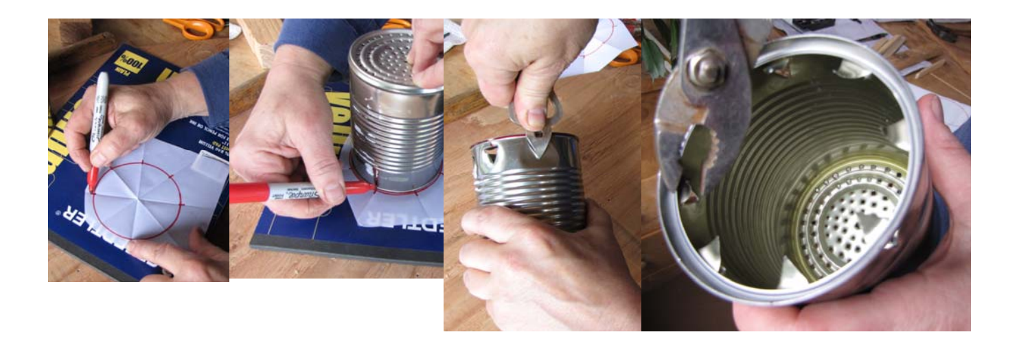
Step 4: Punch air inlet holes in the outer can

Use the can punch to punch 10-12 evenly spaced holes around the bottom of the outer can.