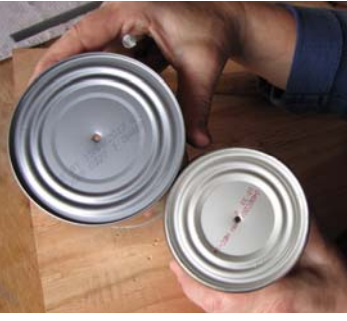
Step 2: Punch primary air feed holes in the bottom of the inner can Air will come up through the bottom of the small can to feed the fire. Take the nail and hammer and punch a large number of holes around the center hole in the bottom of the can. Make sure the entire bottom of the can is covered in holes about 2-3mm apart.